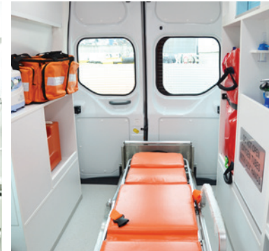
Main stretcher with universal mounting base