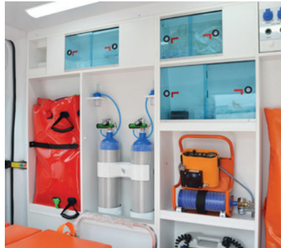
Equipment storage cabinets