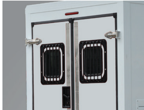
Cabin windows protection