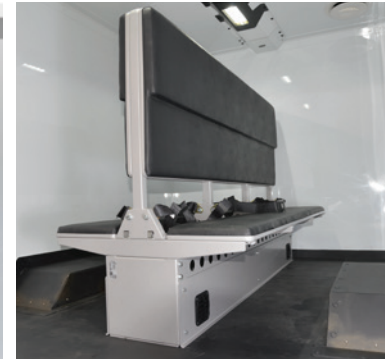
Prisoner seat with seat belt