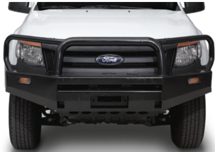
Front protection bull bar