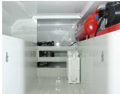
Interior storage for large equipment