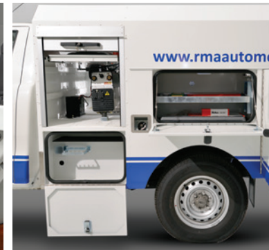
Multiple storage lockers