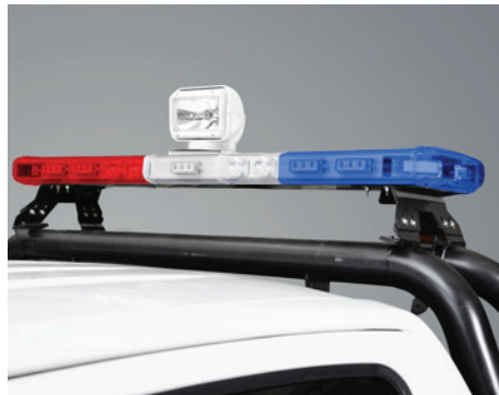
LED light bar