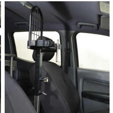
In car rack