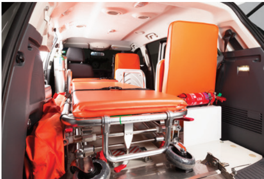
Single stretcher with double attendant seats, storage cabinet