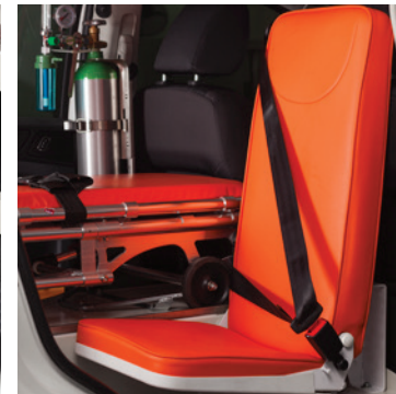
Folding attendant seats