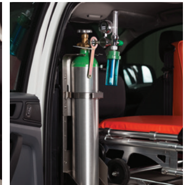
Oxygen cylinder (MD size) with regulator