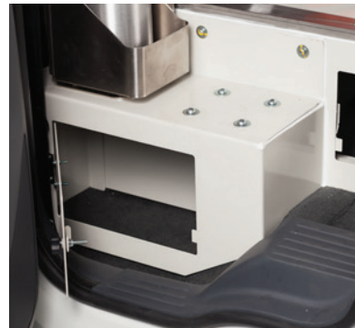
Under floor tools boxes