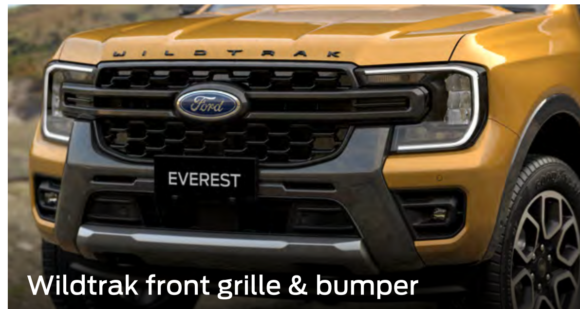
Wildtrak front grille & bumper