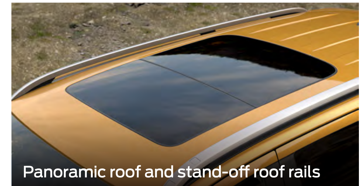
Panoramic roof and stand-off roof rails