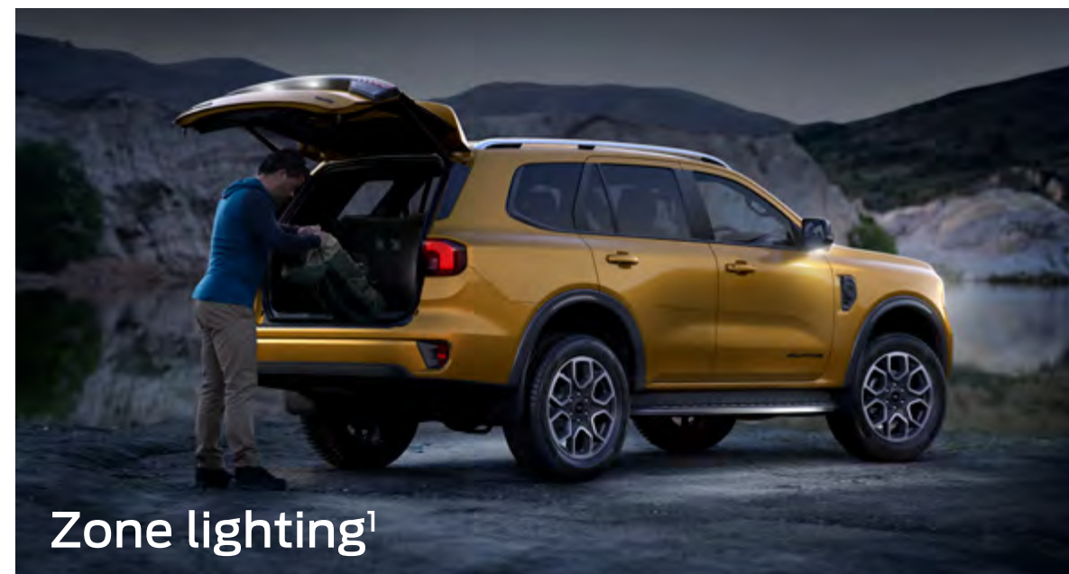
Zone lighting 1