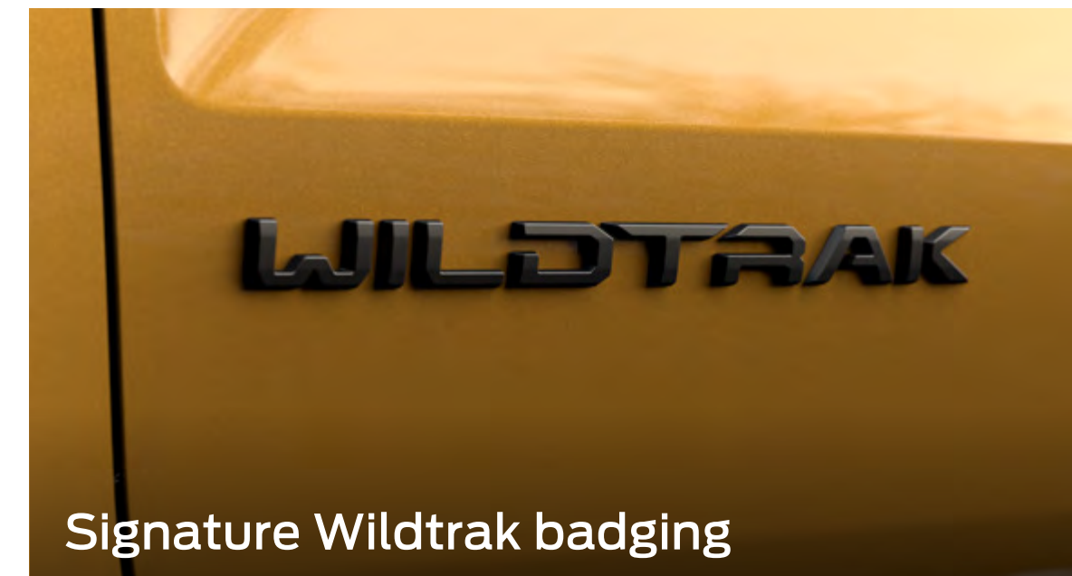
Signature Wildtrak badging