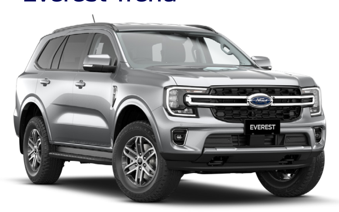
Ruggedly stylish, smart and safe, and ready for it all