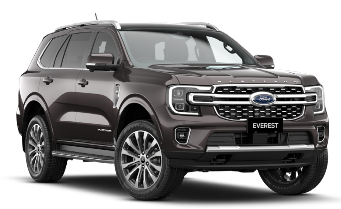
More sophistication and intelligence for every journey